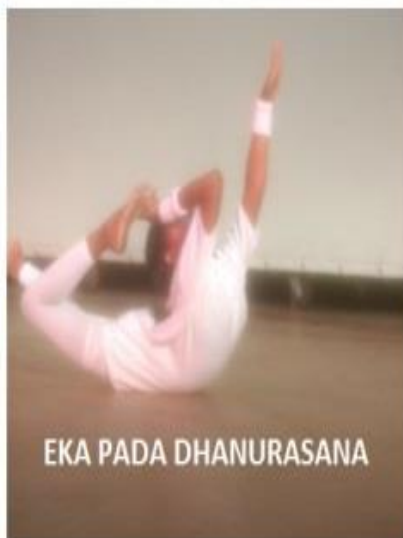
EKA PADA DHANURASANA