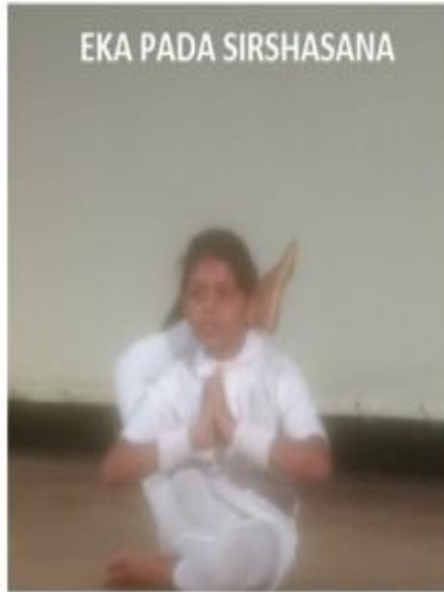
EKA PADA SIRSHASANA